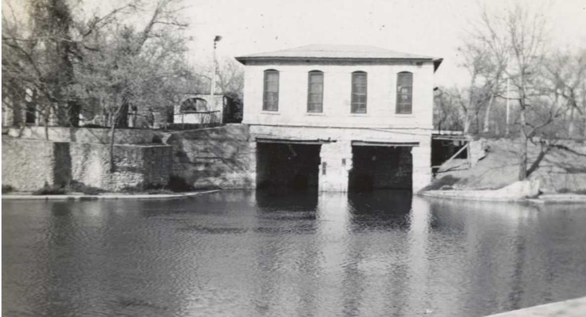
Pump House No. 1 in the 1940s One of oldest existing commercial buildings in San Antonio

As San Antonio grew in the mid-19th century, the increased population meant increased water contamination and bouts of cholera.